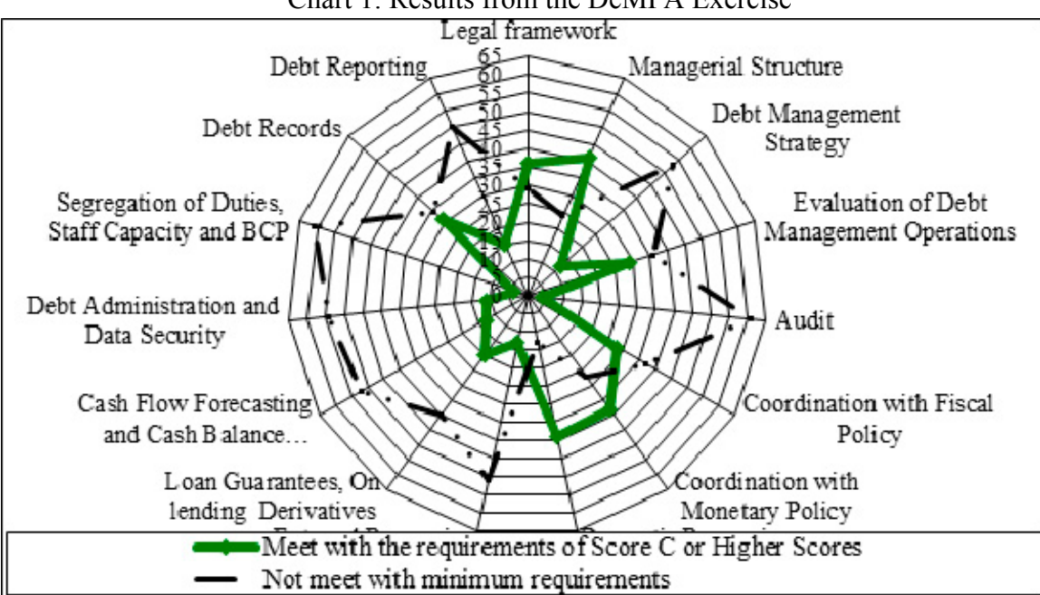
Chart 1: Results from the DeMPA Exercise<sup>5</sup>

B. The diagnostic has also been followed up with technical assistance (TA) to develop detailed and sequenced reform plans. The reform plan aims to alleviate the weaknesses identified and analyzed by the DeMPA or through other assessments. It details expected outputs and outcomes, actions, sequencing and milestones. It also provides an estimate of budget and resources required to implement the plan. With growing demand, reform plan missions have been carried out in 36 countries (see Chart 2).